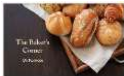
The Baker's Creche 94 Fernside